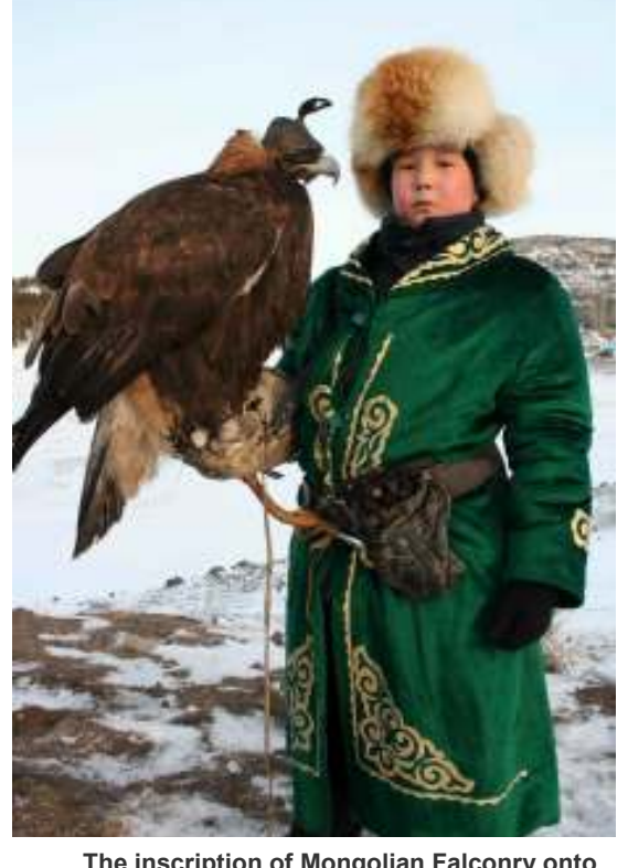
The inscription of Mongolian Falconry onto UNESCO's list ensures the continuance of the way of life of the Kazakh falconers of the Bayan Ulgii region of Mongolia.

Falconry and bird of prey-related stories are eye catching in any publication; even people with little interest in animals are captivated by the noble beauty of eagles, hawks and falcons. We offer some hiresolution images of such birds for use with any coverage you could provide for this recent UNESCO announcement. For further information, I refer you to the attached press release. If I can be of any help whatsoever, do not hesitate to contact me on +353 87 133 0922